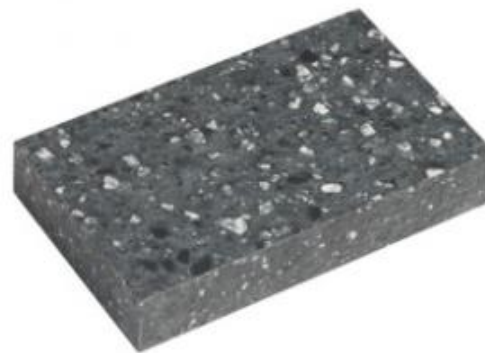
MINERVA SOLID SURFACE - Nimbus Grey