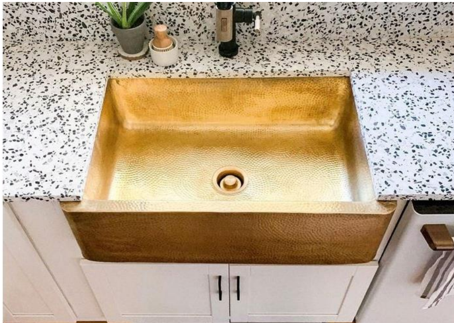
Terrazzo worktop