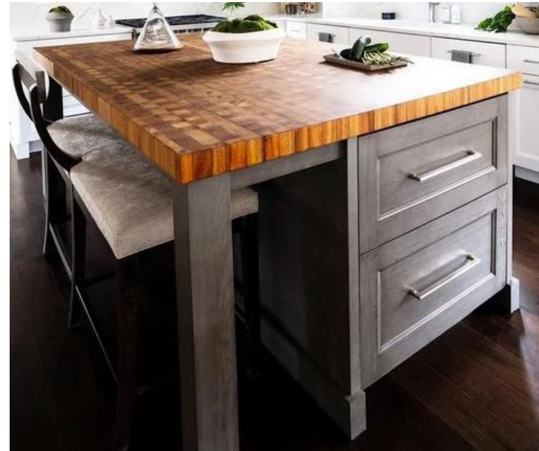
Butcher Block table