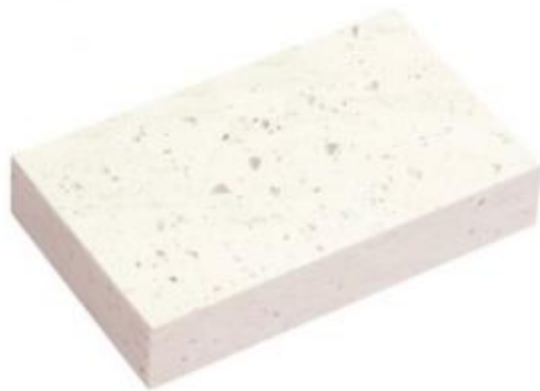
MINERVA SOLID SURFACE - Travertine Haze