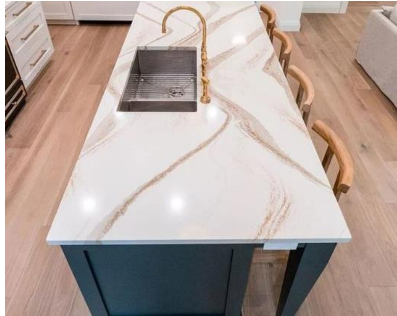
Quartz worktop