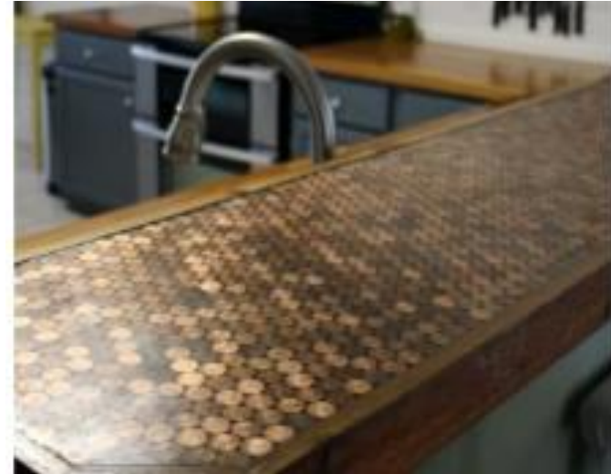
Coins in Epoxy resin