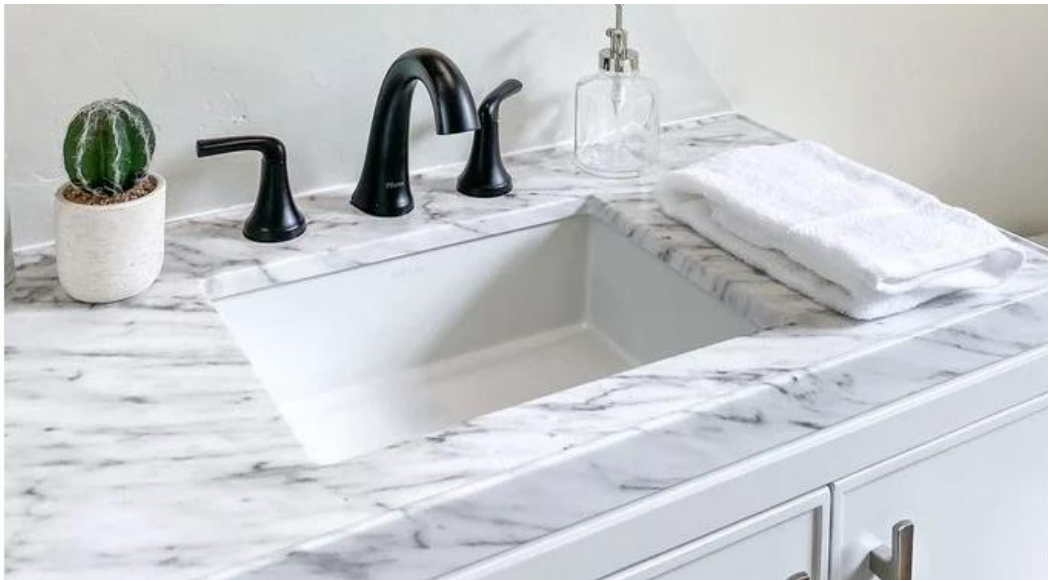
Marble Sink Top.